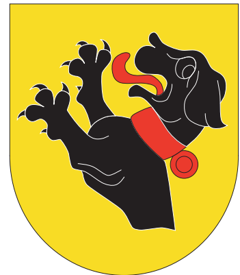
Coat of arms of the Hunziker from Moosleerau