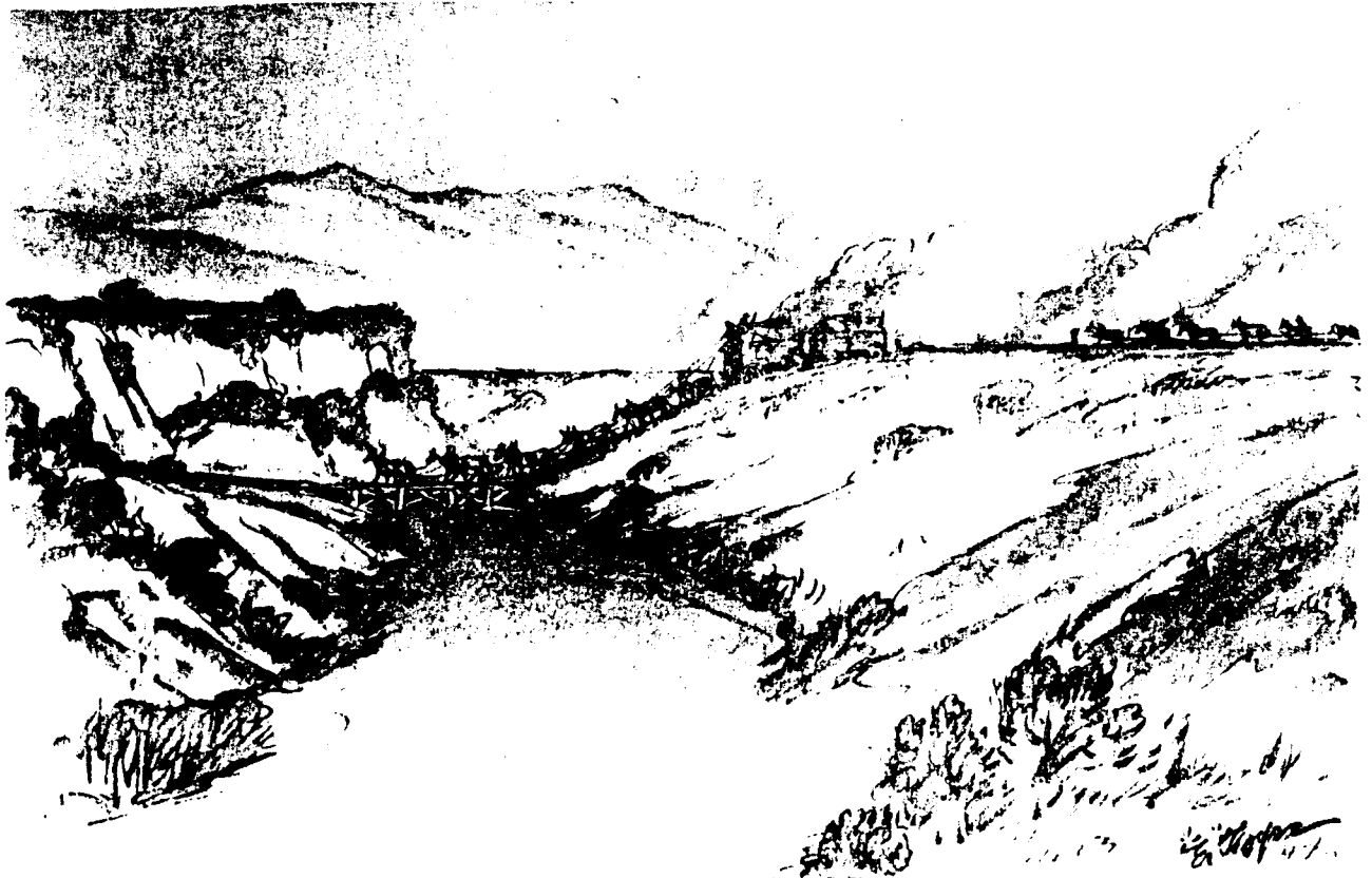
The first bridge over the Bear River.