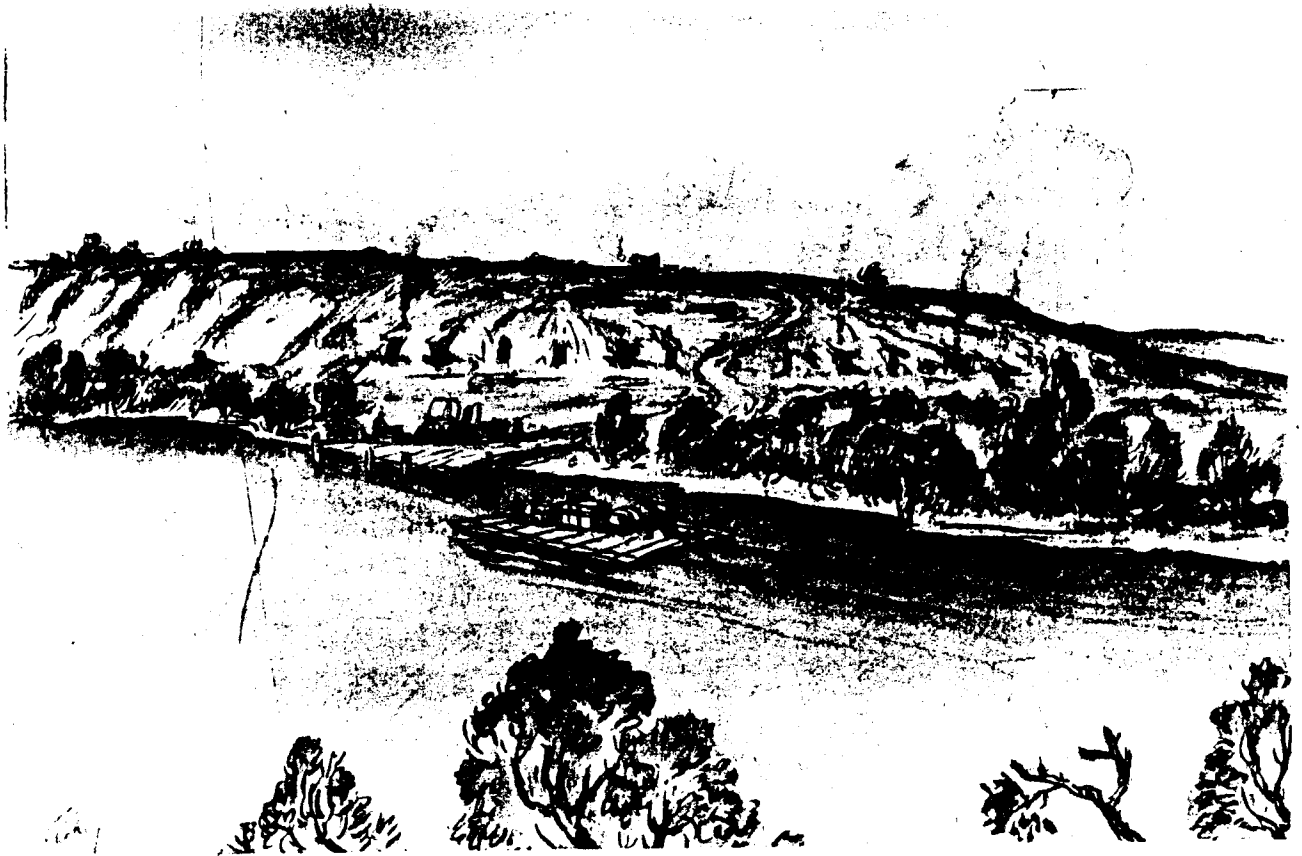
The Ferry on the Bear River. Note the dugouts on the hill. This was called "Cellar City."